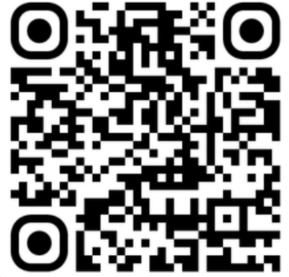
Expression of Interest Form

If you haven't yet enrolled your child/ren at Funhouse, please complete our Expression of Interest Form on our website or by scanning the QR code. Once enrolled, you'll need to submit the Vacation Care Booking Form to secure your child's place.